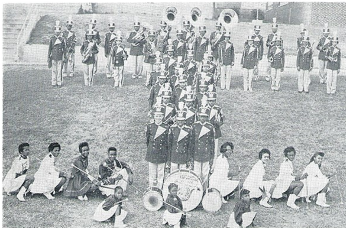
TERRELL HIGH SCHOOL DRAGON BAND DRUM MAJOR, MAJORETTES and MACE CARRIERS